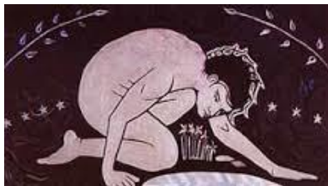
Remember the Greek myth of Narcissus

Individualism does not usually appear in texts about great faith systems, but it IS a dominant heart orientation, a compelling and universal world view. It focuses on ... the individual. ME!! Thinking, acting, making choices for self alone, for reasons of self-interest.